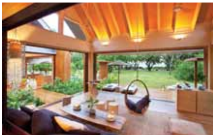
MADAM ZABRE SPA RETREAT